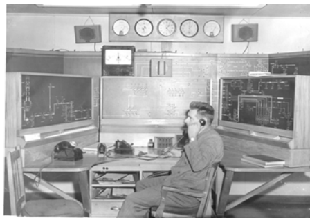
Addington Dispatch Office 1940s