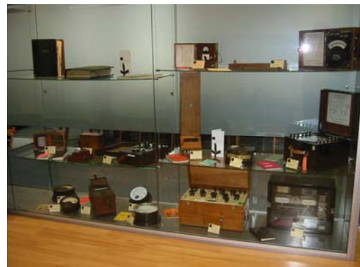
The PSC display at Tawa

Power System Consultants and GridHeritage have worked together to commission an historic display of items from the electricity industry in the reception area of PSC's new building in Tawa, Wellington.