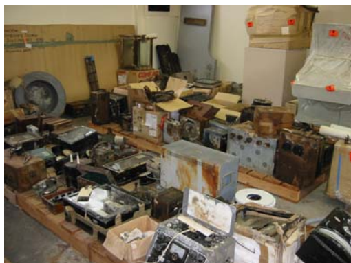
Damaged ECNZ collection now sitting on pallets

We had a trip to Bunnythorpe to undertake the first stage of the preparatory work for the conservator. This meant an initial sorting of the equipment and then raising it off the floor to prevent any further ingress of moisture from the concrete. This is now completed ready for the condition assessment.