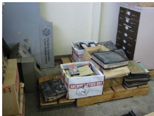
Water damaged ECNZ documents

New Zealand electricity generation and transmission.