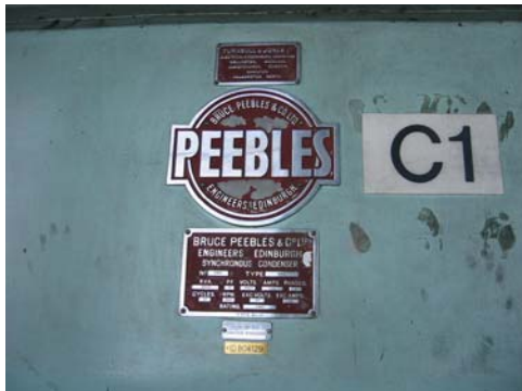
Stoke Condenser nameplate

Another unusual feature of the equipment was the complex control system for starting the machine.